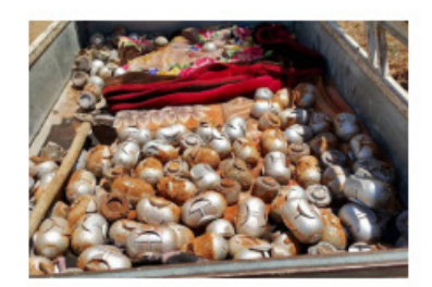
Cluster Munition Monitor 2016