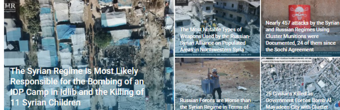
Syrian Regime in Terms of ter Munitions Use