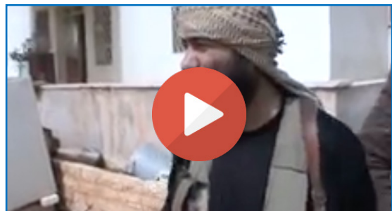
Video footage showing three dead bodies with signs of torture on it

Hezbollah militias executed five people where the residents found their dead bodies tossed in the street. We found out later that they were rebels that were arrested by Hezbollah militias.