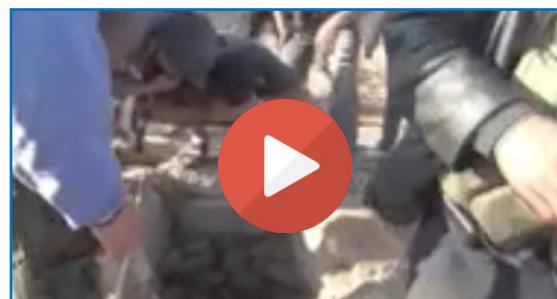
A video footage shows one of the wells in which the bodies were thrown and rebels trying to pull out a body from inside the well

SNHR documented the killing of 15 youngsters whose dead bodies were found in a well in Um Amoud village in the middle of May 2013. According to some testimonies collected by SNHR, the main suspect in such crimes is Hezbollah militias. Some of the residents told us that there is a military checkpoint for Hezbollah near the village which is located in Eastern Aleppo suburbs near As-Sfira.