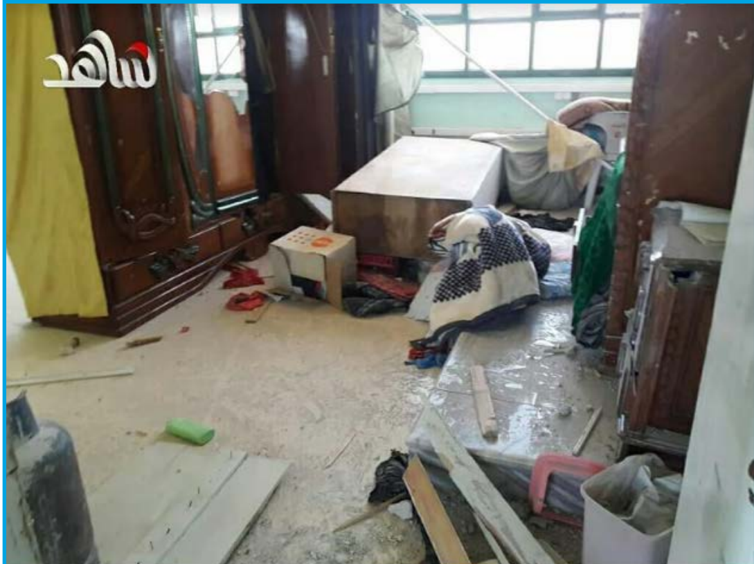
A damaged classroom at the school that was housing IDPs in the aftermath of an aerial attack that targeted Yousef Kiwan School – June 14, 2017