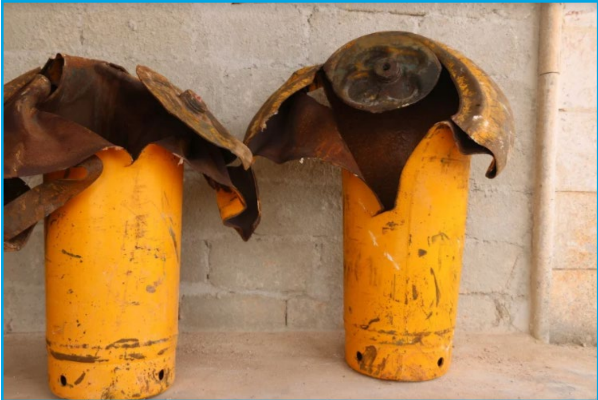
Remnants of barrel bombs, allegedly carrying a poison gas, in the aftermath of an air attack by Syrian government helicopters, Saraqeb – February 4, 2018

Obayda Fadel 4 , a local media worker from Saraqeb city, told us that he headed for the attack site after the attack and examined the holes created by the barrel bombs: “The barrel bombs landed in two sites that were separated by no more than 50 meters. They didn’t create a huge destructive impact. The diameter of both holes was no more than one meter. The grass color in the vicinity of the area where the barrel bombs landed had turned into yellow and became similar to ashes. I also noticed a white sand substance on the ground in the same place.”