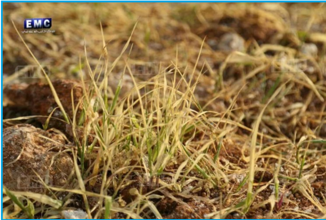
The effects on the surrounding grass in the area where barrel bombs loaded with a poison gas landed, as the grass turned into yellow, Saraqeb – February 4, 2018