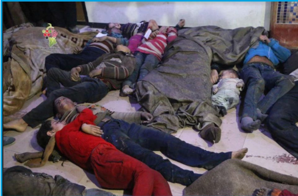
Victims killed in a massacre carried out by Syrian regime forces who carried out a chemical air attack on Douma city, Eastern Ghouta – April 7, 2018