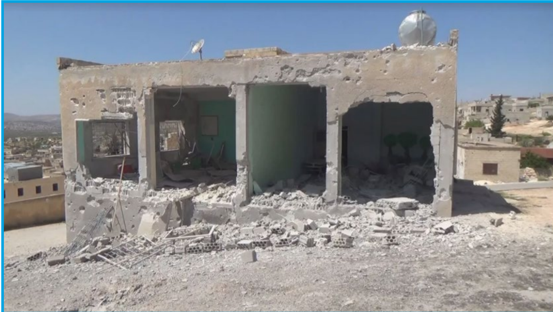
Destruction at the health center in Kafr Sajna, Idlib in the aftermath of an air attack by Syrian regime forces using barrel bombs – April 25, 2018