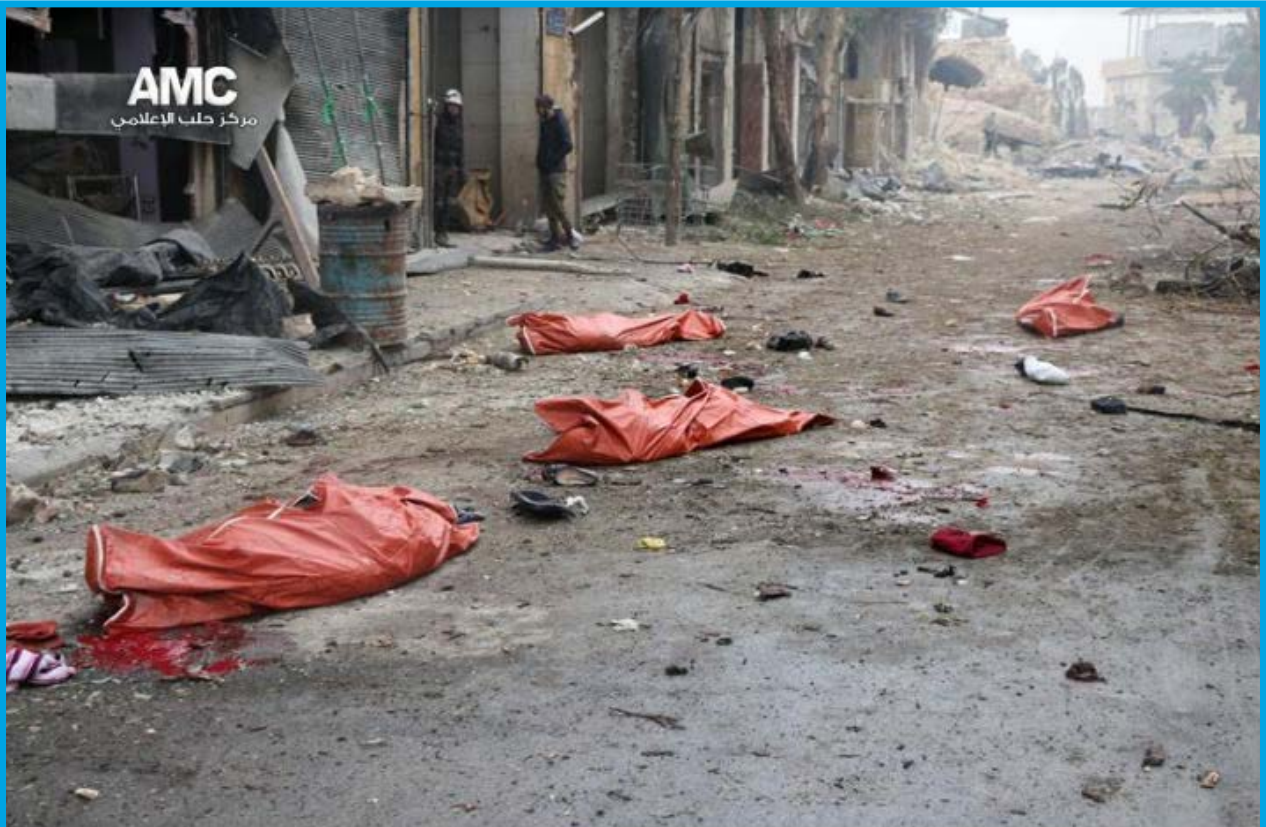
Dead bodies for victims killed in Jub al Qubba neighborhood attack by Syrian regime forces using Gvozdika shells – November 30, 2016