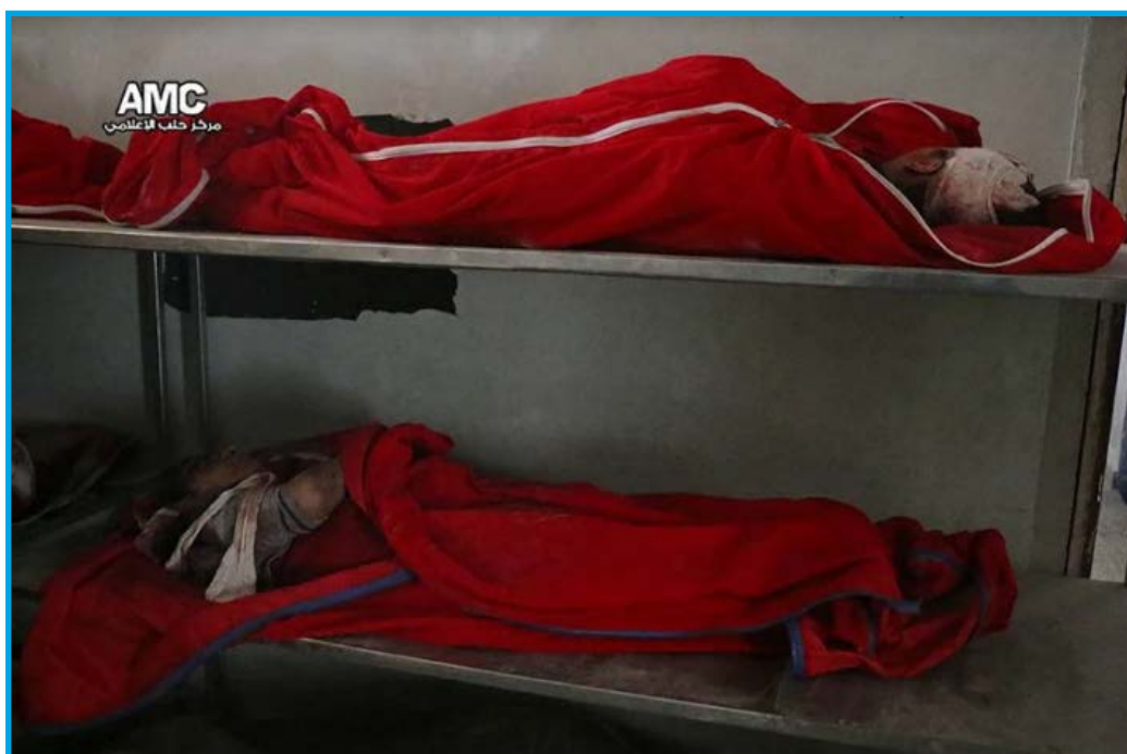
Victims killed in the attack on Jub al Qubba neighborhood by fixed-wing warplanes we believe were Russian – November 29, 2016

Abu al Izz said that he couldn’t identify the type of warplanes that targeted the area because of the heavy bombing.