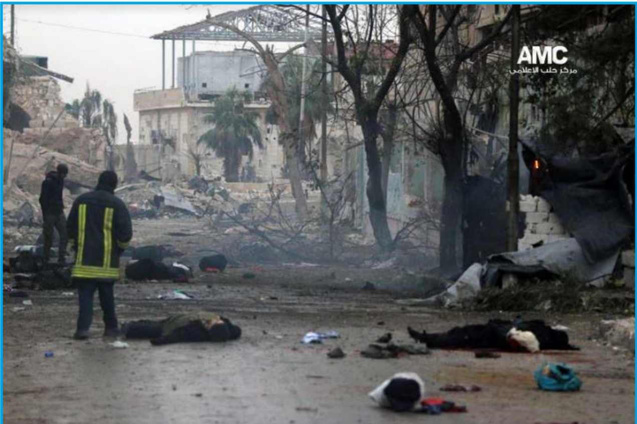
Victims and huge destruction in the aftermath of an attack by Syrian regime forces using Gvozdika shells that targeted displacing civilians – November 30, 2016