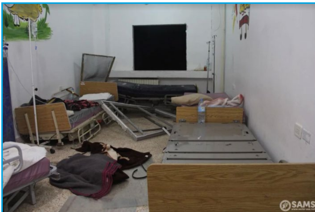
Damages in the aftermath of a car bomb's explosion of unknown source near Idlib Central Hospital, Idlib – May 12, 2018