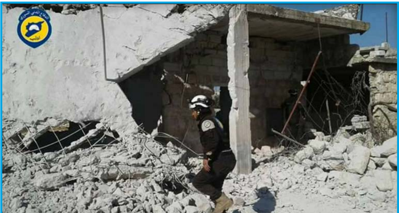
Picture showing the destruction in the aftermath of Syrian regime helicopters dropping three barrel bombs on al Bashiriya village in the western suburbs of Idlib, Friday, March 24, 2017

Video showing a barrel bomb being dropped by Syrian regime helicopters and its explosion in Kafr Zita city in the northern suburbs of Hama governorate, Sunday, March 19, 2017