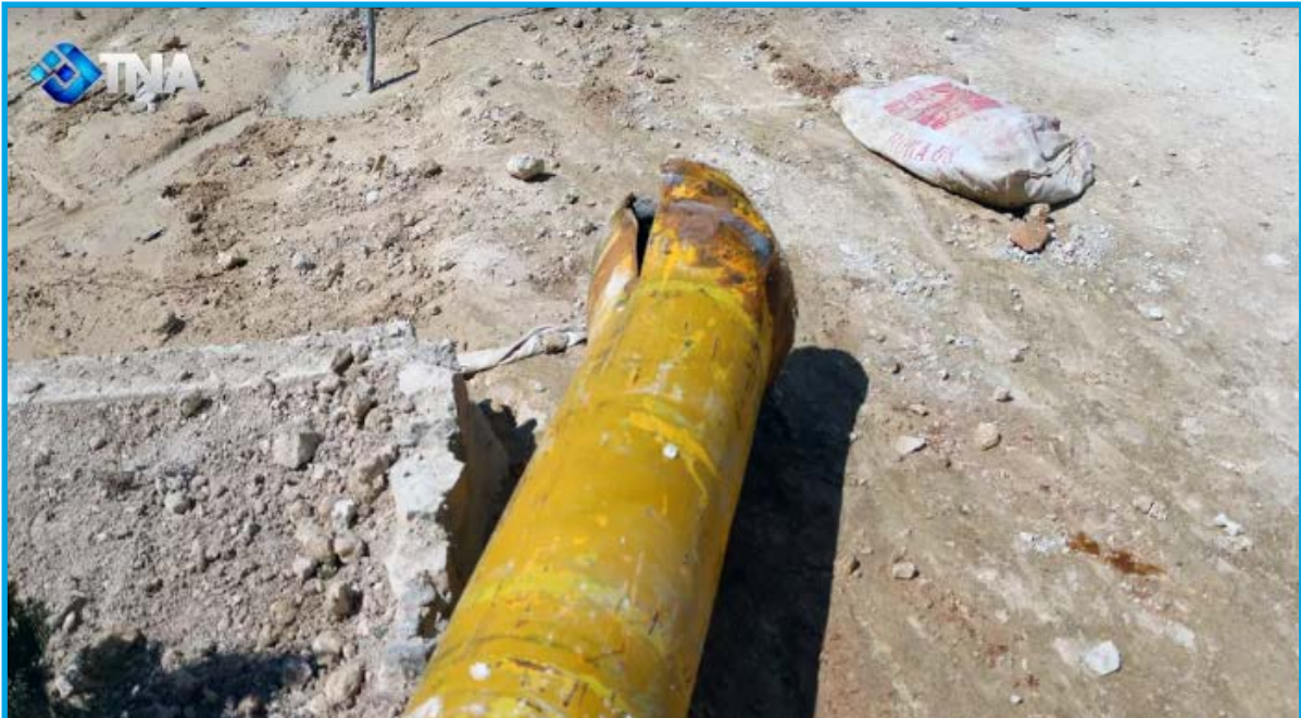
Picture showing remnants of a barrel bomb containing cylinders loaded with a poison gas after it was dropped by Syrian regime helicopters on al Latamna city in the northwestern suburbs of Hama governorate, Saturday, March 25, 2017