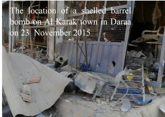
The location of a shelled barrel bomb on Al Karak town in Daraa on 23 November 2015