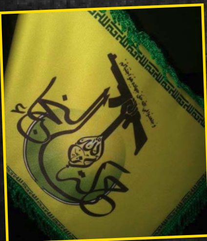
Al-Nojaba'a Movement logo