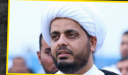
Qays Al-Khaza'aly - Sayid Ash-Shohada' Brigades leader