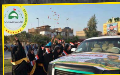
Funerals of victims of Sayid Ash-Shohada'a Brigades