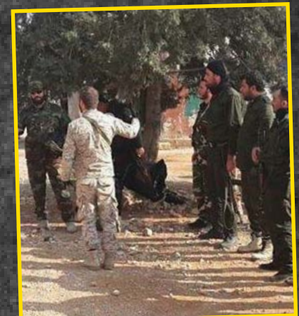
Personnel of Assado-Allah Al-Ghaleb Brigade