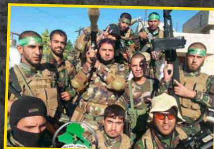
Personnel of Kafeel Zaynab Brigade