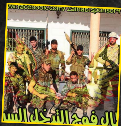
Personnel of SWAT Regiment