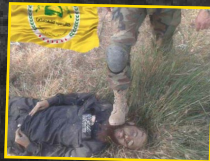
Images showing Sayid Ash-Shohada'a Brigades' personnel insulting the opposition victims' bodies