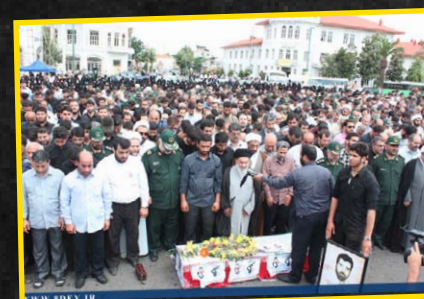
The killed General Hassan Shateri - the Iranian Revolutionary Guards