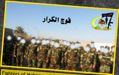
Fighters of Mohammad Baqer As-Sadr forces - Badr Organization - the Military Wing