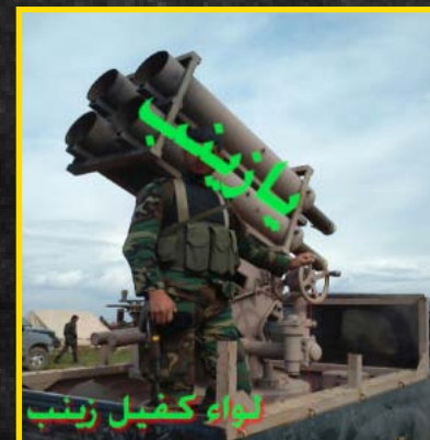
Multiple rocket launcher - Kafeel Zaynab Brigade