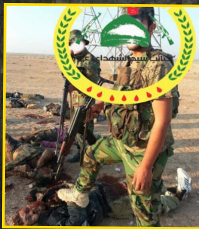
Images showing Sayid Ash-Shohada'a Brigades' personnel insulting the opposition victims' bodies