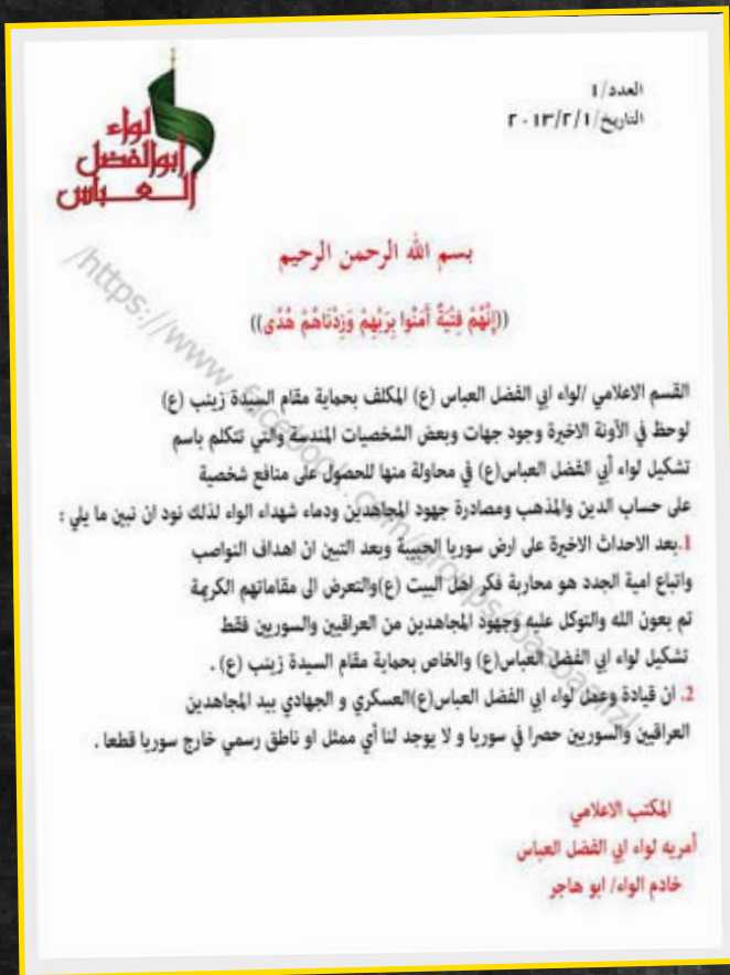
Abo Al-Fadl Al-Abbas Brigade - the organizing statement