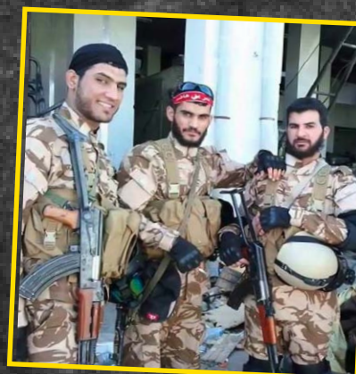
Personnel of Tho Al-Faqar Brigade