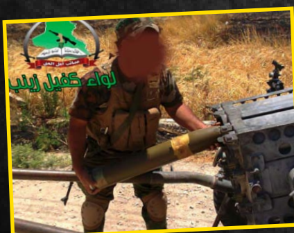
Personnel of Kafeel Zaynab Brigde while using multiple rocket launcher