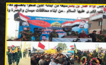
Funerals of victims of Ammar ben Yaser Brigade in Meesan governorate