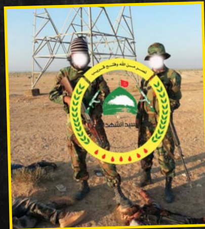
Images showing Sayid Ash-Shohada'a Brigades' personnel insulting the opposition victims' bodies

https://drive.google.com/file/d/0B5pudHajcbMuTkJXVmRnRDJNeU0/edit?usp=sharing