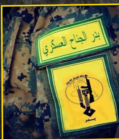
Badr Organization - the Military Wing logo