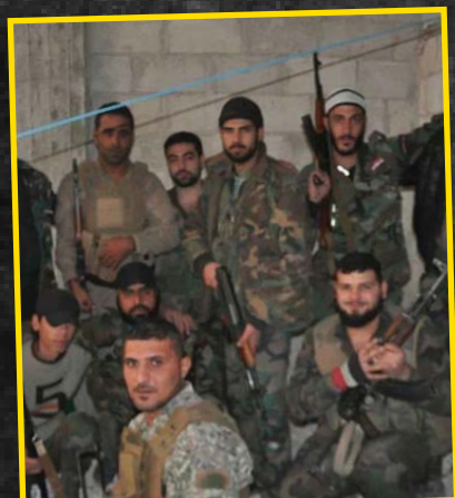
Personnel of Tho Al-Faqar Brigade in Adra city