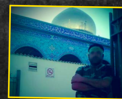
Personnel of Kafeel Zaynab Brigade in front of Sayyidah Zaynab shrine