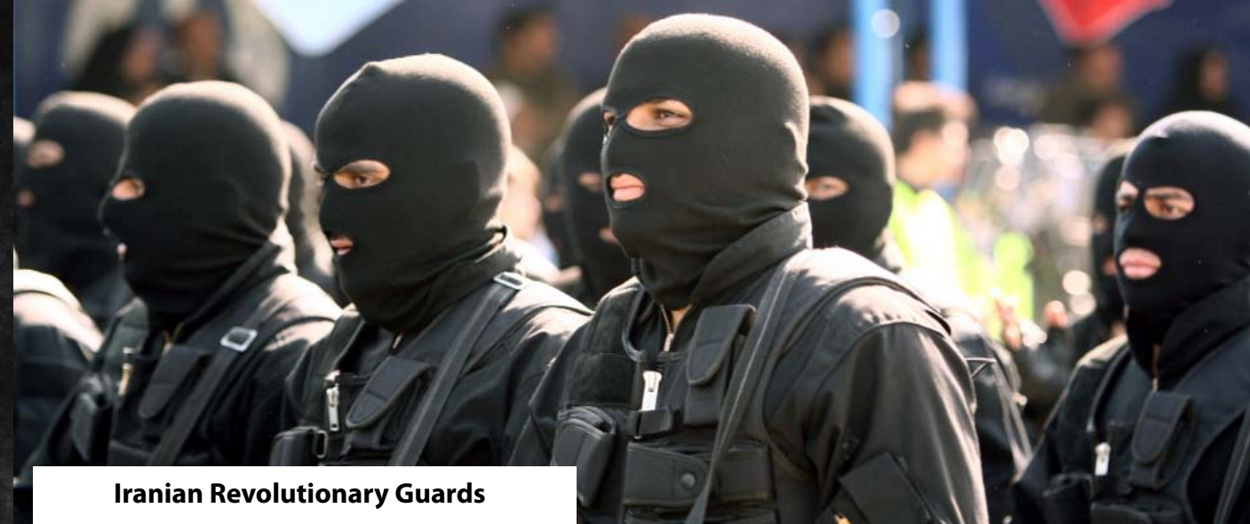
Iranian Revolutionary Guards

The armament system is based mainly on the following weapons: :RPG-7s , PKM , AK-47 , M16 , and Steyr HS.50, in addition to mortar cannons, 23 mm and 14.5 machine guns, multiple rocket launchers, and Gvozдика cannons owned by Al-Hamd Brigade affiliated to Hezbollah Al-Nojaba in Alepo. This weapon system also includes surface to surface rockets of the type Borkan (Volcano) and Zelzal (Earthquake) ,which have been used in shelling many areas in Ghouta, Qalamon, and Deraa, beside anti-tank guided missiles (ATGM) like Konkurs and Metis, and using advanced Night Vision Devices (NVD's) which has the ability to observe movements in distant areas (5 km). It should be noted that the official Syrian Army support these militias with tanks and the availability to use its heavy weapons by them under mutual coordination. The use of war helicopters to shell areas, such as Aleppo and Ghouta, with barrel bombs by Iraqi militias, Lebanese Hezbollah, and Iranian Revolutionary Guards personnel has been documented.