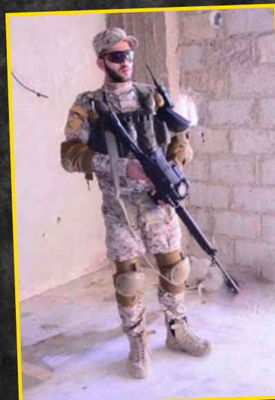
Personnel of Al-Hasan Al-Mojtaba Brigade