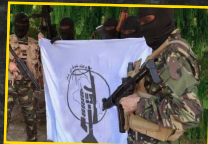
Personnel of Badr Organization - the Military Wing