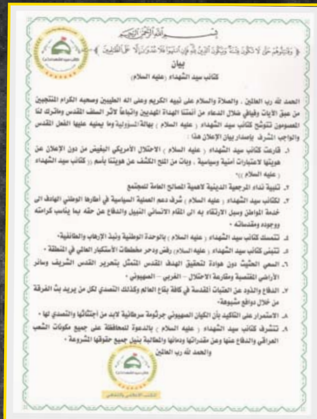
The statement of establishment of Sayid Ash-Shohada'a Brigades - 8 May 2013