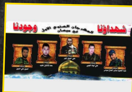
Victims of Al-Nojaba'a Movement - Al-Hamd Brigade